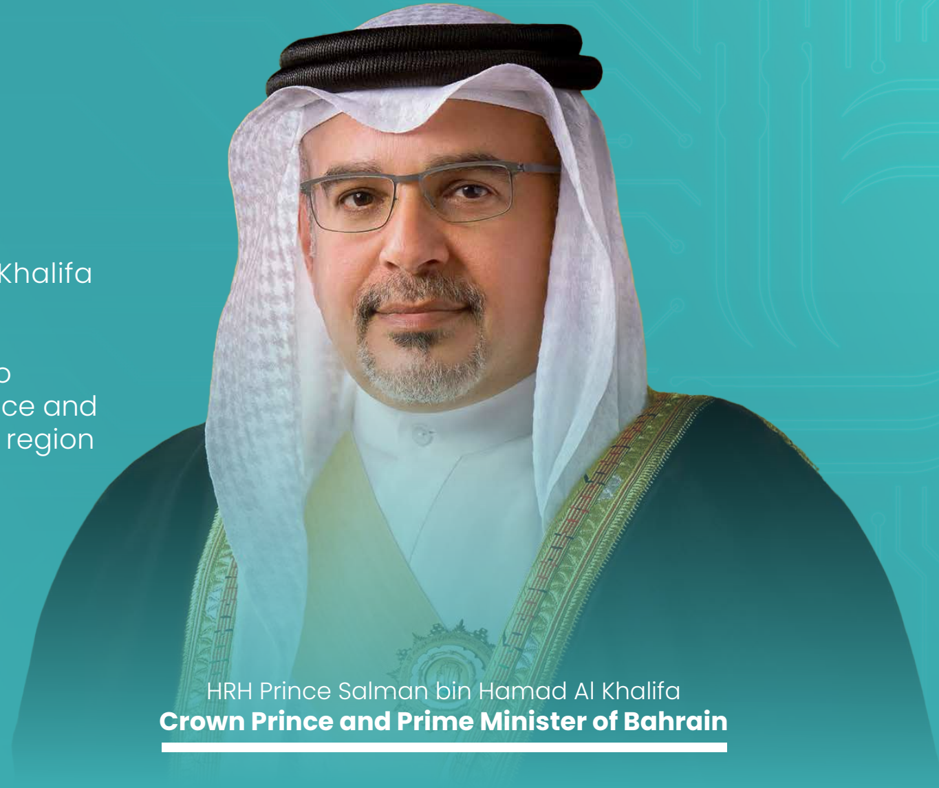
HRH Prince Salman bin Hamad Al Khalifa Crown Prince and Prime Minister of Bahrain

The Gulf Downstream Association (GDA) is proud to announce the International Downstream Conference and Exhibition (IDCE), uniting industry leaders from the region and beyond.